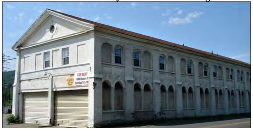
Figure II-3 Photo of the Trolley Barn / CT&I Building